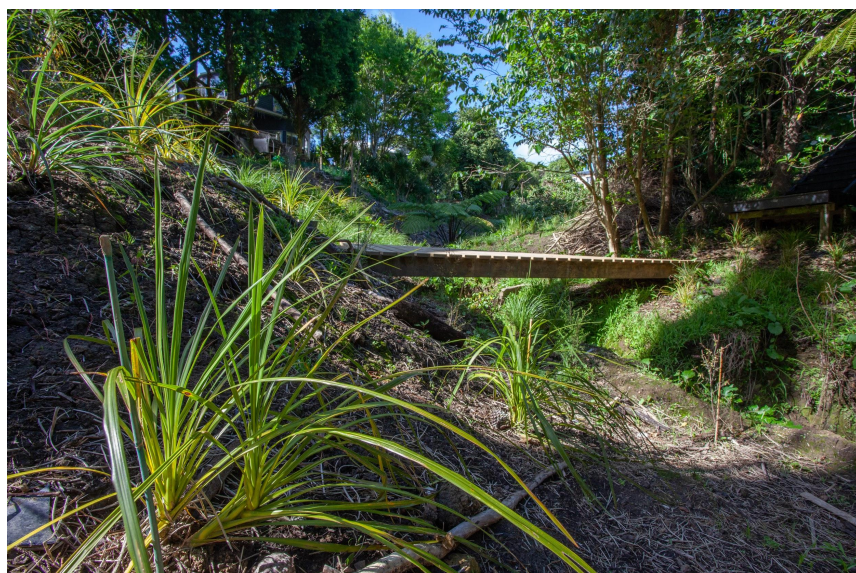
Restoration in progress

Pipe and slip - Watercare has completed geotechnical and site assessments of the pipe and slip at the western end of the stream and have undertaken to repair them. In the interim the pipe and manhole structure have been supported.