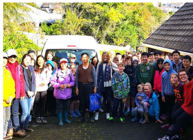
June Planting Day