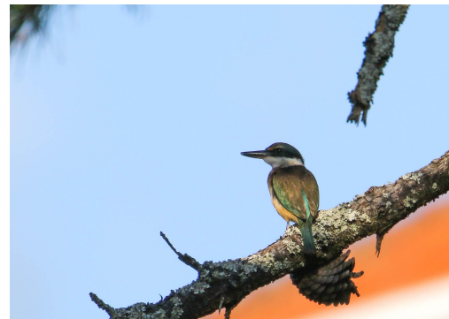
Sacred Kingfisher spotted in the restoration area

Late Sept: Weed control will be undertaken in Unit 4 (see map attached), Ada St side of the stream in preparation for planting. We will notify everyone affected personally - some of you have said you will look after your own weeds and we have noted that. As well there will be continuing maintenance for Units 1/2/3 (see map).